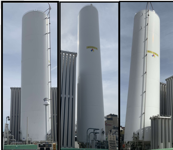
Chart 16,000 gallon LNG tank 2010 S/N 23059