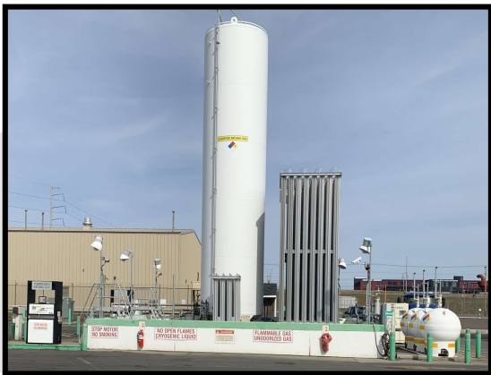
Chart LCNG Station completely intact Station is designed to dispense LNG and CNG simultaneously